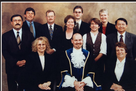
First elected Council of the City of Greater Dandenong, 1997-2000