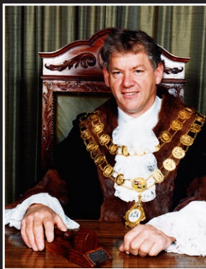
Cr D. J. Kelly; Mayor of City of Dandenong, 1994