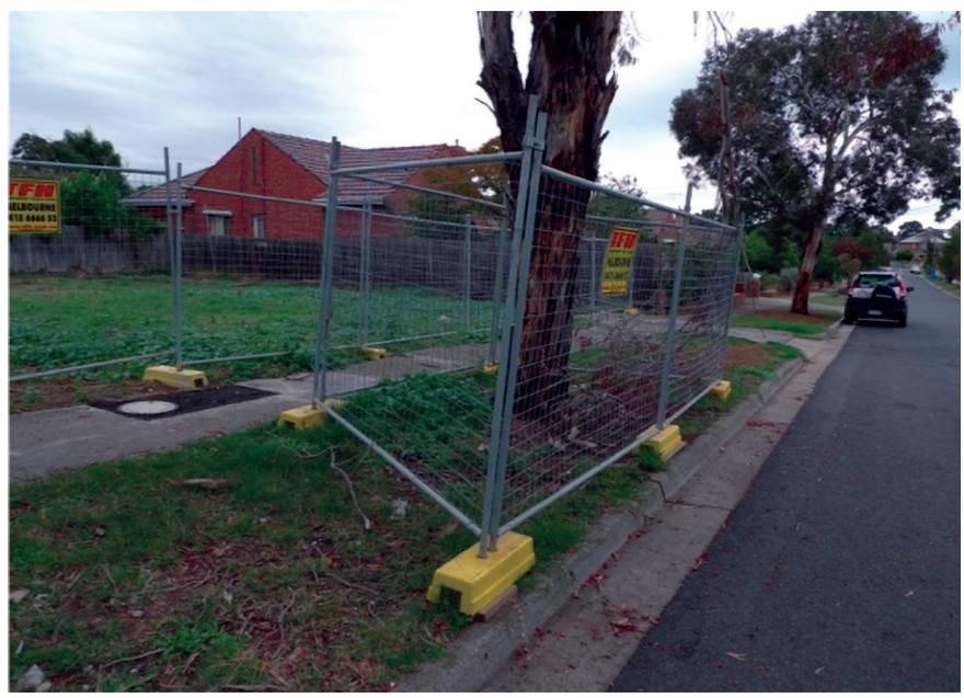
Figure 2: Photograph above left - example of signage for TPZ. Photograph above right - example of appropriate TPZ fencing around a street tree.

For further information visit greaterdandenong.vic.gov.au/trees