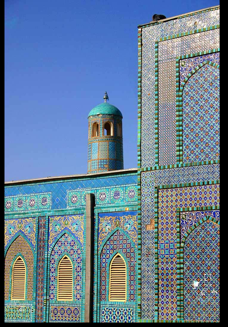
The Blue Mosque of Mazar-e-Sharif:

An architectural and generic celebration of Afghan Cultures attributed to both Sunni and Shi`a artisans.