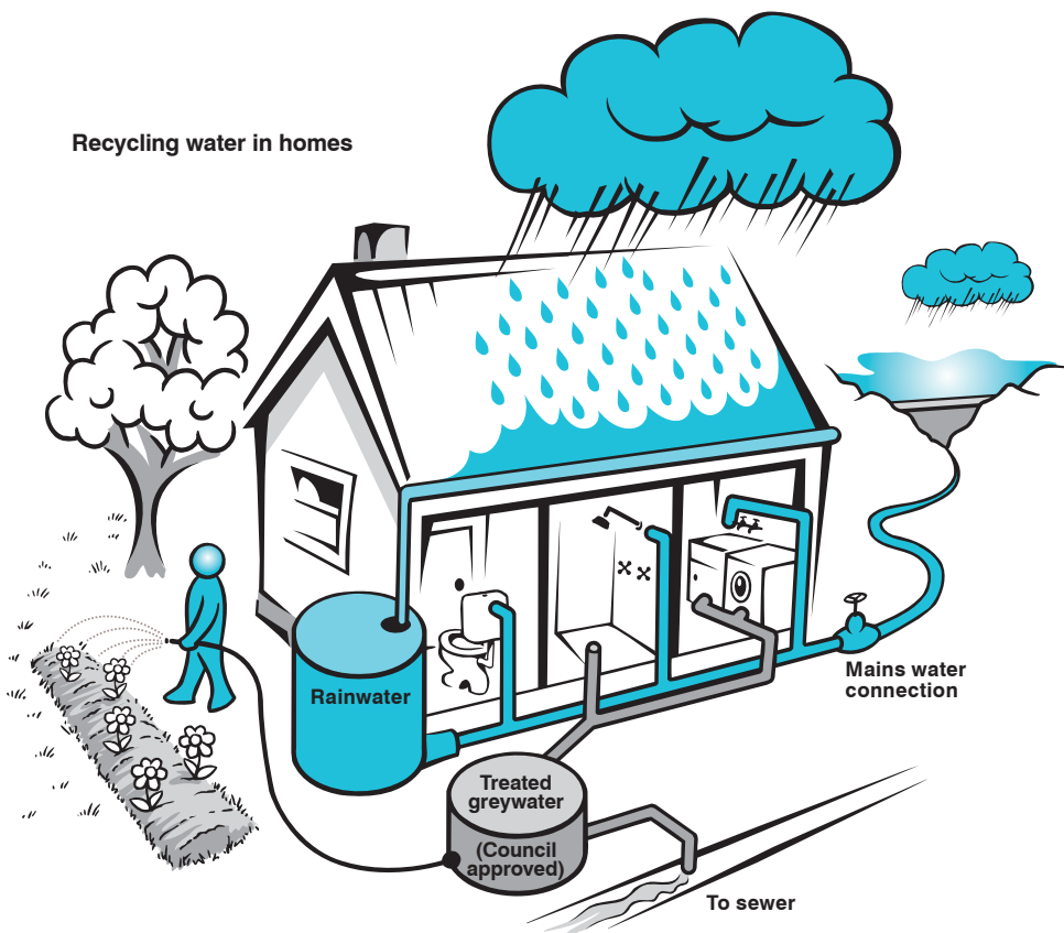
Recycling water in homes

Prior to planning a greywater treatment system, you need to obtain advice from a licensed plumber, the Department of Health and the Environment Protection Authority. A permit from Council is required.