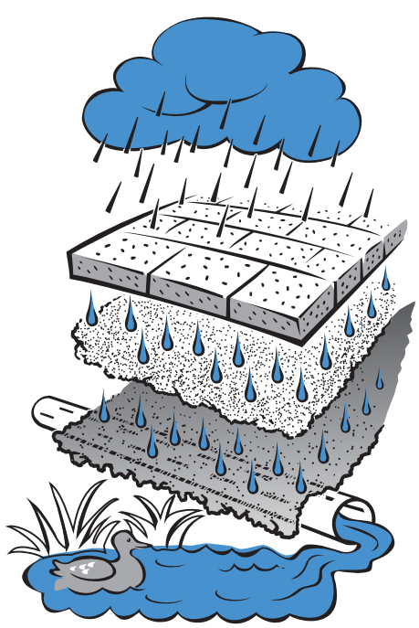
Porous paving will allow for drainage in urban areas.

Porous paving is installed in the same way as traditional paving and is available in many forms. They can be used to replace asphalt, concrete or other impervious pavers.