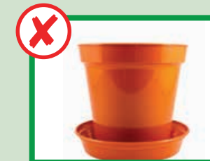
No plant pots