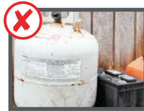
Contaminated with incorrect items