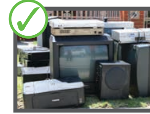
Televisions and computers