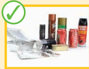
Clean foil trays, empty aluminium, steel, and aerosol cans

Don't overfill your bins and place recycling materials in loosely