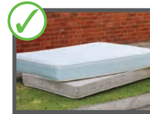
Mattresses (maximum of 2)