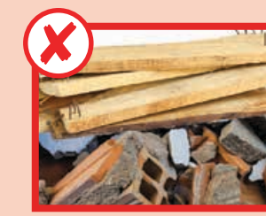
No timber and building materials