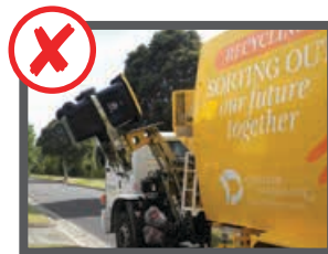
Too heavy (80+kg)