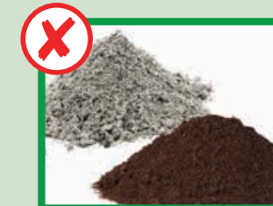
No rubble, dirt or ash