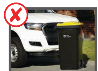
On the road, pathway or driveway

Need to know your garbage day? Visit greaterdandenong.com/waste or call 8571 1000