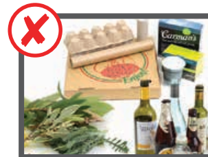
Household waste, recycling products, garden waste