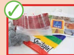
Plastic bags and wrapping