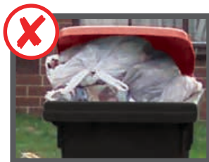
Overloaded (lid cannot close)