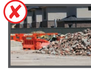
Building and renovation materials (bricks, concrete or asbestos)