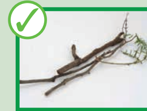
Small branches. Sizing for branches 10cm x 30cm