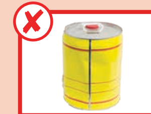
No paint, oil or liquids