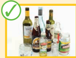
Empty glass bottles and jars