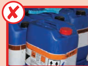
No hazardous chemicals