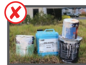
Gas cylinders, chemicals, pesticides, paint and hazardous waste