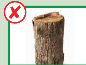
No logs or stumps