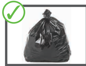
Bag your general waste