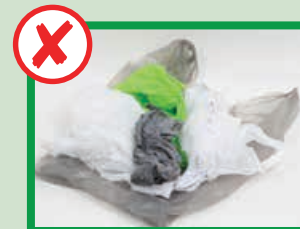
No plastic bags