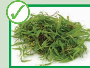
Grass clippings and weeds

Make sure your garden waste is free of soil