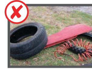
Car parts, tyres, batteries and engine blocks