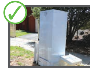
Whitegoods and metals