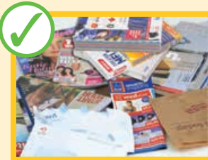
Newspapers, magazines, papers, envelopes, letters, telephone books and catalogues