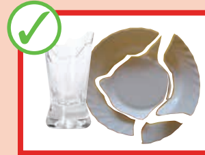
Ceramics and broken glass