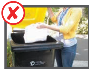
Don't put plastic bags in recycling bin