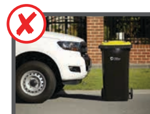
Next to parked cars