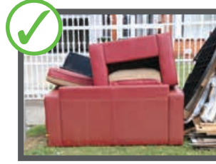
General household furniture and other items