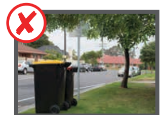
Under large trees and branches