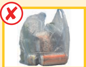
No recycling in bags