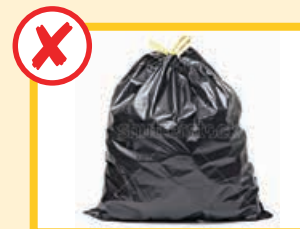
No general waste