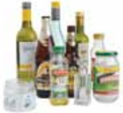
Empty glass bottles and jars