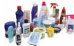
Empty plastic bottles and containers