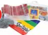
No plastic bags