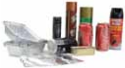
Clean foil, trays, empty aluminium, steel and aerosol cans