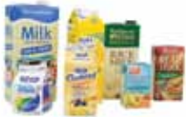
Milk and juice cartons