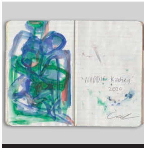
Callum Jackson, Untitled (Journal Entry) , Watercolour Paint and Biro on Paper 2020

This exhibition will use both coloured and invisible ink to uncover the feelings that many refugees grapple with, but are unable to find a place to express.