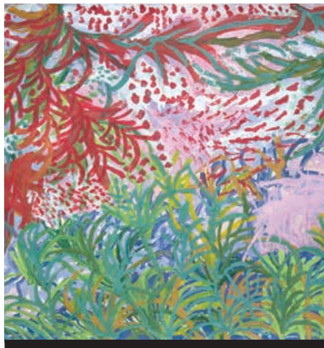
Georgia Szmerling, National Park Wildflower Manitoba Canada Bay Coast , 2017, acrylic on paper, 50 x 70 cm, GS17-0006, represented by Arts Project Australia, Melbourne