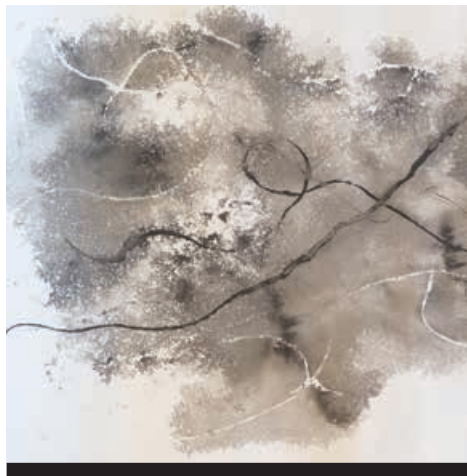
Zakiria Tahirian, Untitled , ink on paper