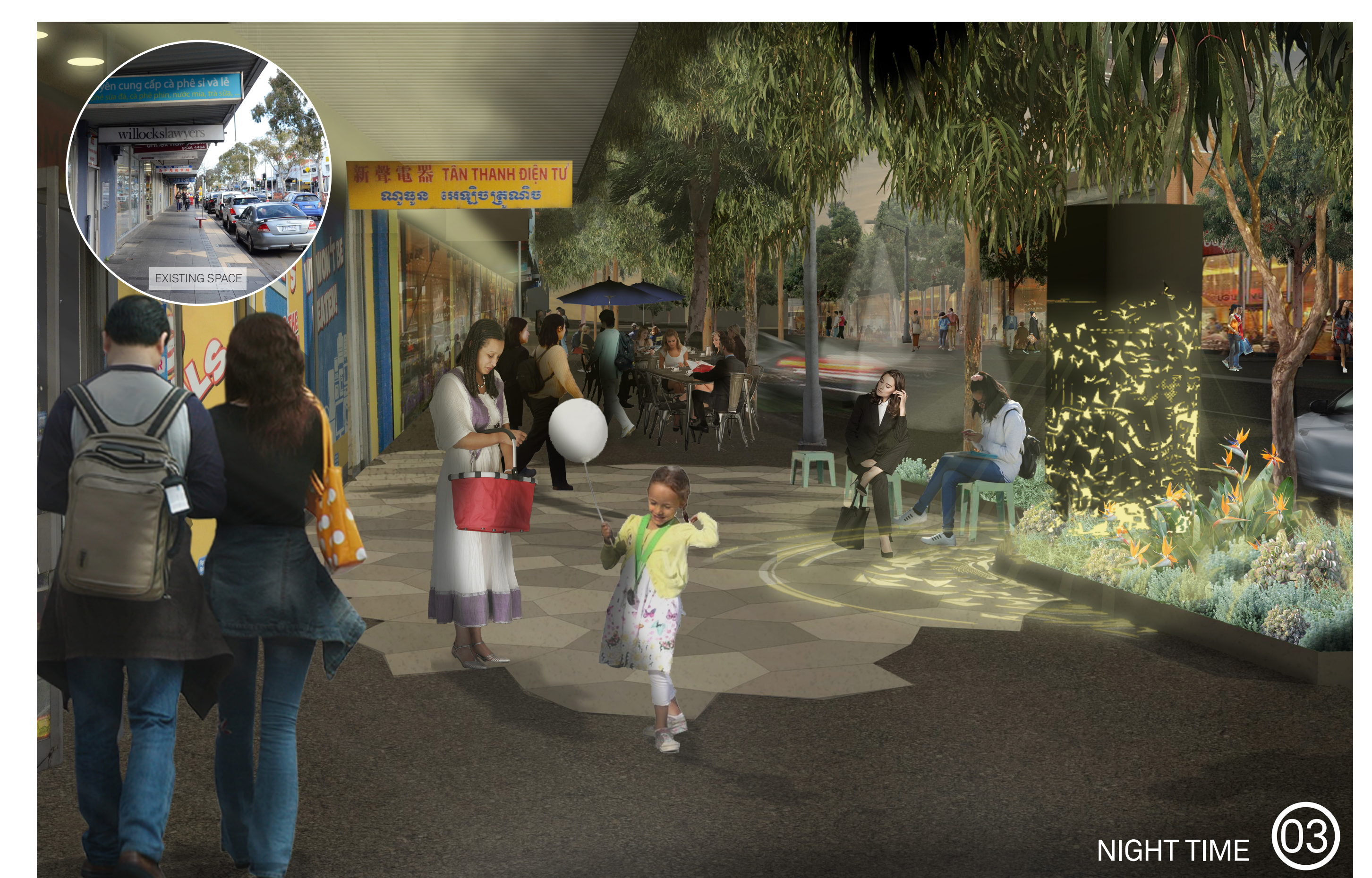
A PLACE FOR PEOPLE

The streetscape design was developed in response to community aspirations, collected from over 1000 locals. The new look Springvale Road will feature new seating, public art, garden beds and trees, improved street lighting, safety enhancements including CCTV and more footpath space for pedestrian and trader activities.