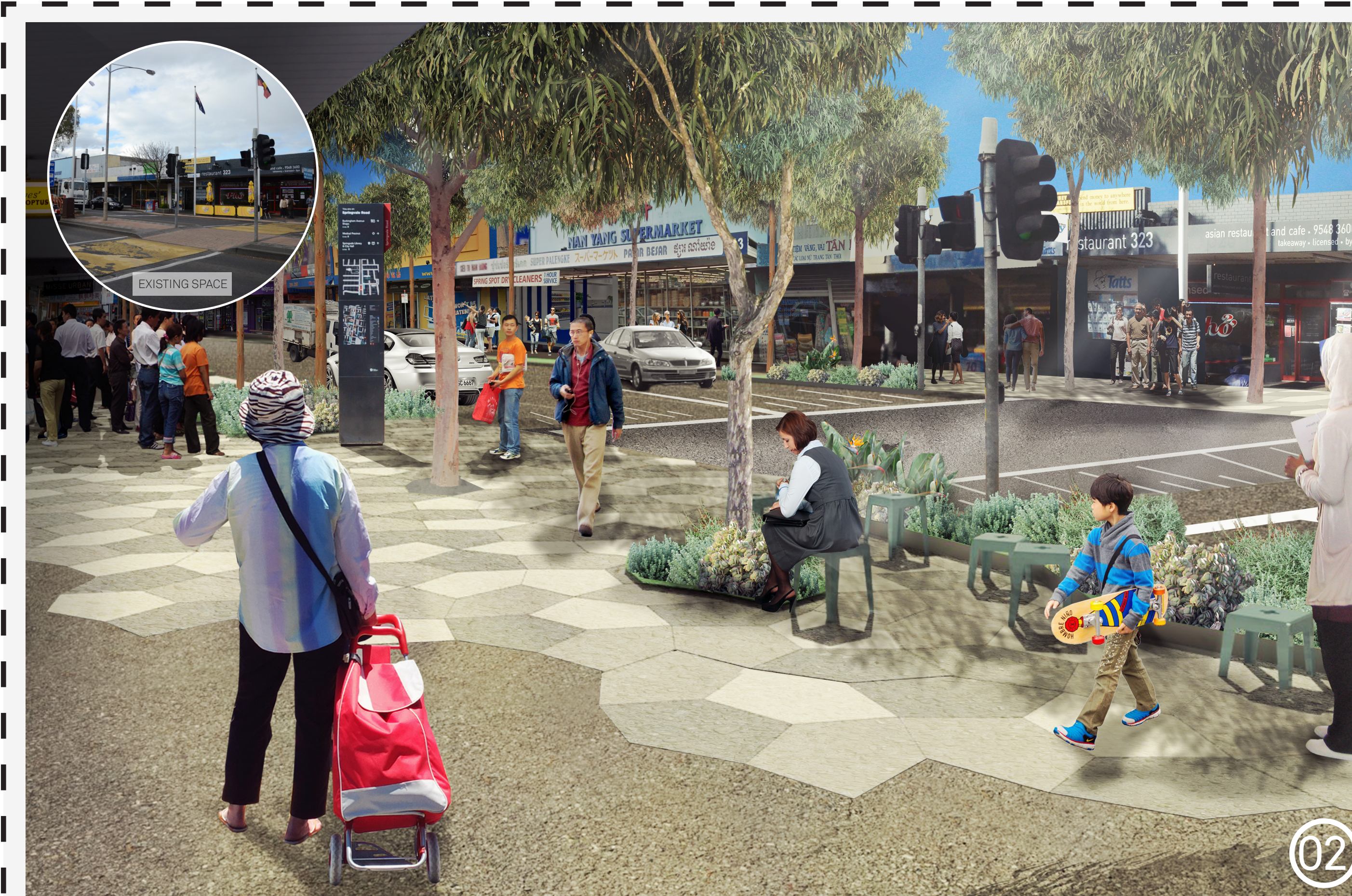
POST OFFICE LANE CONNECTION