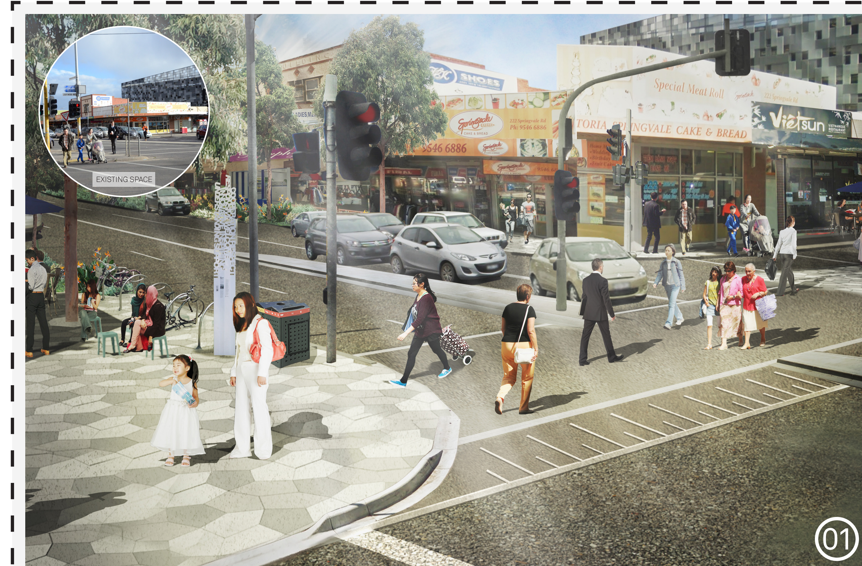
SPRINGVALE STATION CONNECTION