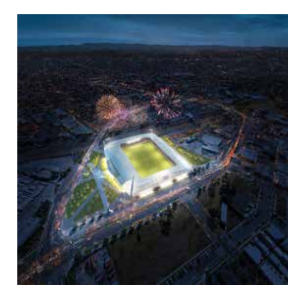
Artistic impression of proposed Dandenong Stadium which accompanied the Team 11 bid in 2018.

Melbourne City's junior teams started training at existing facilities at Casey Fields in February, with all of the players and staff planning to officially relocate mid-year ahead of an anticipated completion of its new training base in March 2022.