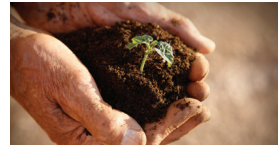
After 6-8 weeks it is ready to be used in horticulture