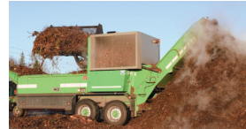
Garden waste is chipped

Garden waste is kept separate from other waste to prevent contamination