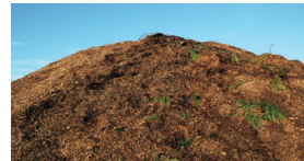
Composted to kill weed, seeds and pathogens