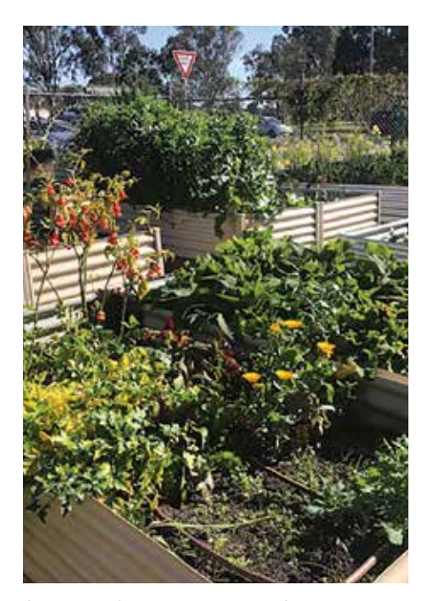
Community Garden at Noble Park Community Centre

Following a survey of over 300 community members, enliven was able to identify the four main challenges to growing food which are knowledge, time, cost and space. As a result, the campaign has created a series of beginner-friendly resources, informative blog posts, videos showcasing local people and their gardens, seasonal recipes, and more recently have launched a 'South East Melbourne Community Garden Directory'.