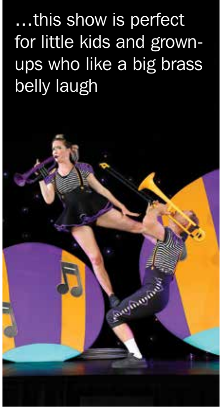
Leg stand blast by Brass Monkeys

Brass Monkeys celebrates kids who march to the beat of their own drum. Bursting with high calibre acrobatics, comedy, live music and high-flying tricks, this show is perfect for little kids and grown-ups who like a big brass belly laugh.