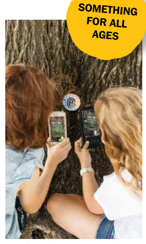
Hidden Creature Gallery, Arena Theatre Company