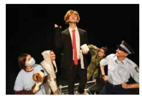
Love in the Time of Corona