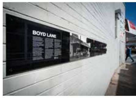
These will reference the 100 years of pharmacy practice at 275 Lonsdale Street.