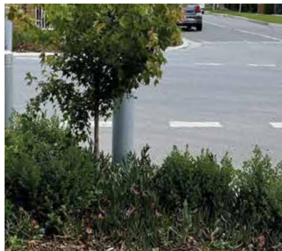
CARPROBROTUS GLAUDESCENS & WESTRINGIA