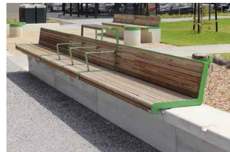
CONCRETE WALL WITH TIMBER SEATING