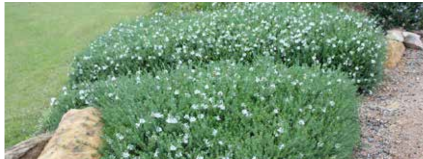
WESTRINGIA FRUTICOSA MUNDI