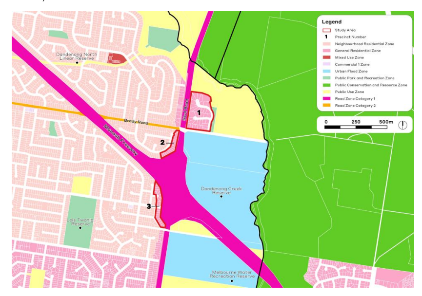
Figure 1 - The land affected by the amendment shown within the red boundary in Precinct 1, 2 & 3.

The amendment affects residential land in and around Cardinia Close, Dandenong North and part of the western side of Stud Road (south of Brady Road to Cheam Street, Dandenong North) (see Figure 1 below).