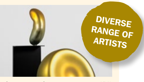
Nadège Desgenetéz, Elemental Bodies (#1), 2022