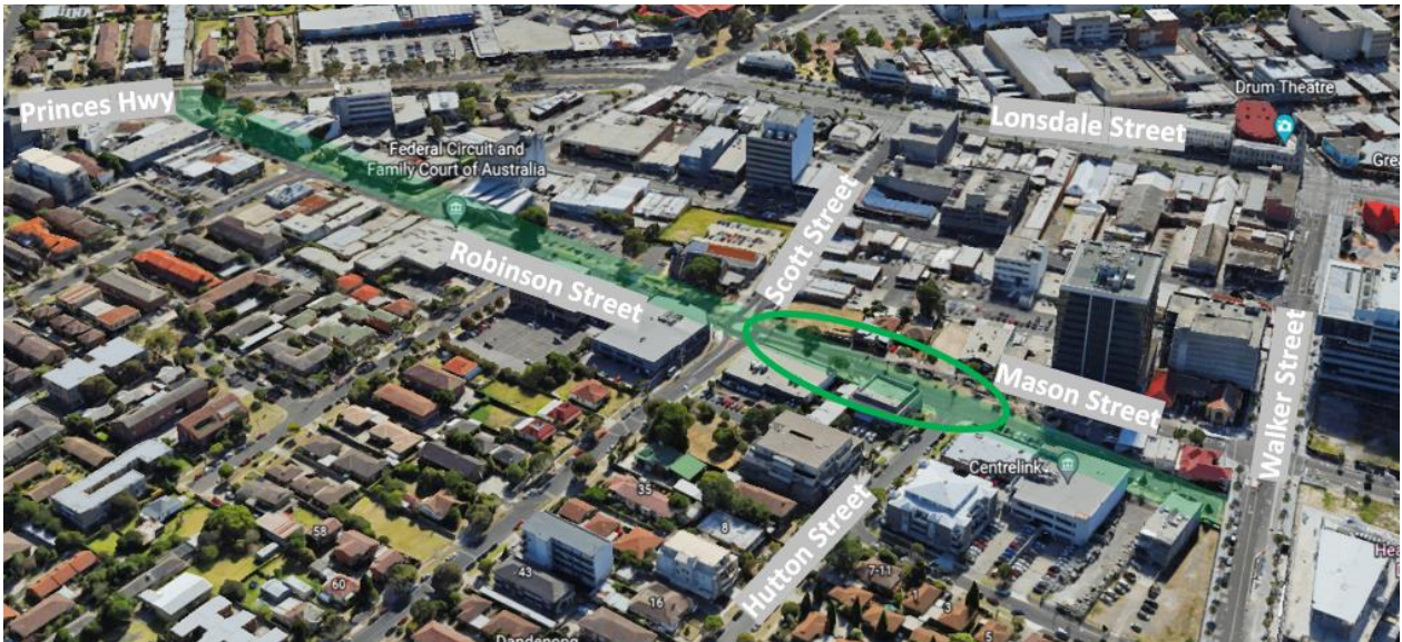
Figure 1: Project area highlighted within the green circle