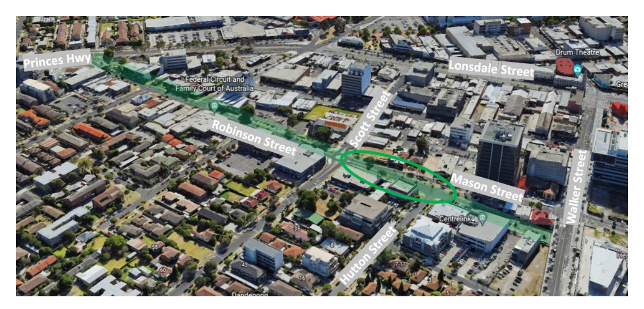
Figure 1: Project area highlighted within the green circle